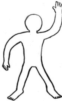
Figure 1: Template for the drawing of language portraits

In recent years, the research group at the University of Vienna has collected and evaluated several hundred of these multimodal language portraits in the context of various projects. It is of course true that the metalinguistic commentaries of speakers and the visual and verbal representations of their repertoires, which emerge during the research process are representations produced in a specific interactional situation. We do not consider them an image of the linguistic repertoire 'the way it really is', nor as an 'objective' reconstruction of the history of language acquisition. Selection, interpretation, and evaluation take place in the visual mode as much as in the verbal mode, and representation and reconstruction do not occur independently of social discourses. With this acknowledgement, in the following section, I single out one of these portraits and submit it to a close reading to show what this approach has to offer in terms of exploring linguistic repertoires.