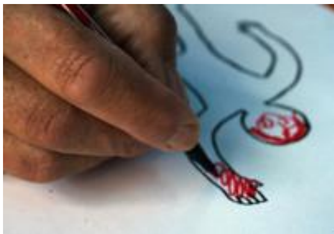
Figure 1: Doing a language portrait