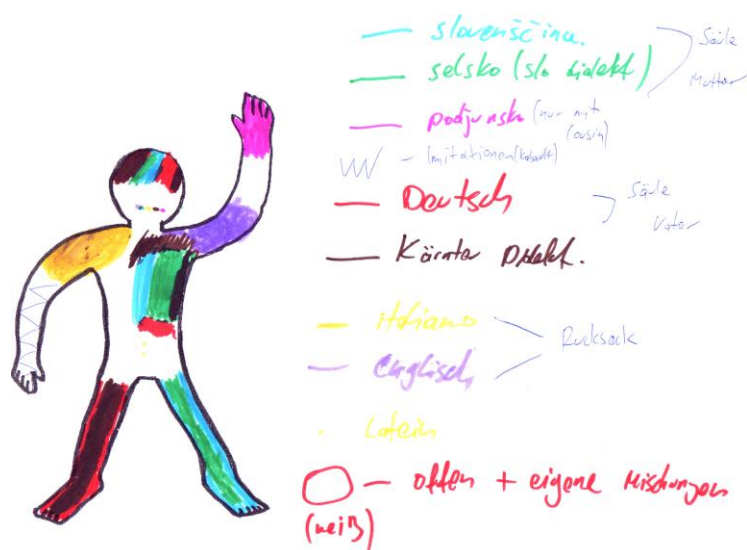
Figure 3: Example of language portrait

The language portrait that is exemplified here (Figure 3) is taken from a workshop with 17 to 18 years old students at a bilingual school (German and Slovenian) in Carinthia. In Peter's portrait the dominant feature was structured according to parts of the body. He characterized one foot as German and one as Slovenian ("the two pillars"), and in his words they also stand for the language of the mother and that of the father. In the heart he sketched in the Slovenian and the German dialect, while in the head "the German language is actually predominant,